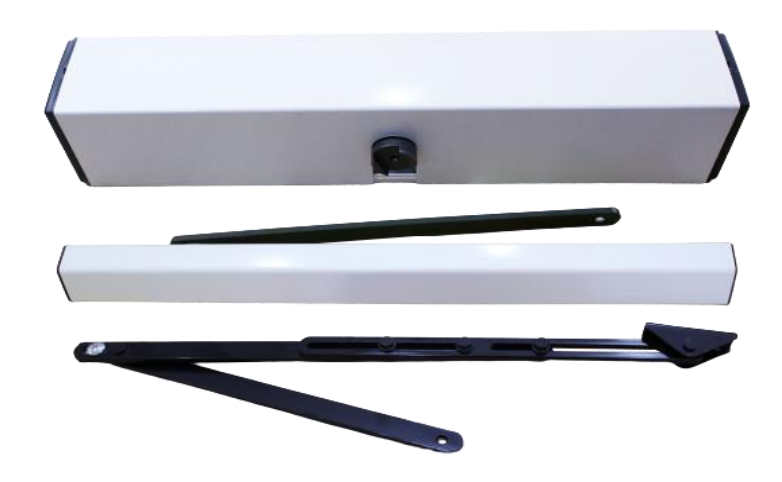
Swing Door Operator

OEP-SW12 swing door operator is an intelligent automation device designed for automatic door opening control. It adopts a brushless motor and features high efficiency, high torque, maintenance-free and long lifetime. When used with authentication devices or sensors, it can realize automatic door opening by authentication. It can be widely used in main entrance/exit scenarios such as hospital protection doors, automatic doors in buildings, fire doors, etc.